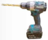
Cordless Drill with 12mm drill bit