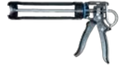
Caulking gun for 300mm Cartridge